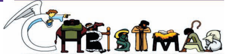
CHRISTMAS IS THE CELEBRATION OF THE BIRTH OF JESUS, THE SAVIOUR OF MANKIND