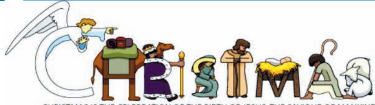
CHRISTMAS IS THE CELEBRATION OF THE BIRTH OF JESUS, THE SAVIOUR OF MANKIND