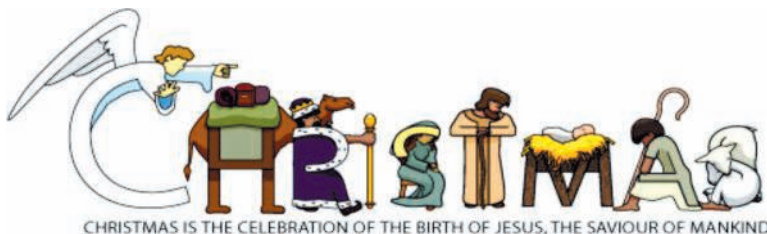
CHRISTMAS IS THE CELEBRATION OF THE BIRTH OF JESUS, THE SAVIOUR OF MANKIND

First Reading: Isaiah 52: 7-10 Second Reading: Hebrews 1: 1-6 Gospel: John 1: 1-18