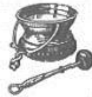
Holy Water Bucket & Aspergillum

Credence table: the side table that holds the chalices, paten, cruets, and purificators when they are not being used at the altar.