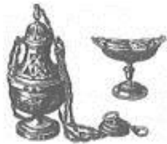
Thurible & Boat

Monstrance: the ornately decorated, large metal object used to display the Blessed Sacrament during Eucharistic Adoration.